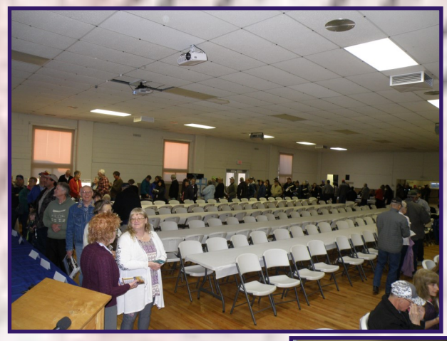
Above: Members taking their place in line for the blood draw.