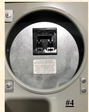
#4: Closeup shows 100 Amp breaker in the on position. (switch up)

If your breaker is in a center position (neither on nor off), you must move it to the off position, then push it up to the on position to reset it. If it drops back to the center (tripped) position, the problem is with your equipment and you will need to call an electrician to troubleshoot the problem for you.