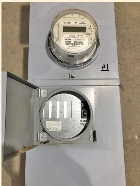
#1: Meter is at the top, and the breaker or breakers will be behind the door on the bottom half. If the meter's LCD screen is blank, you have no power.