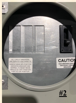
#2: Closeup shows 200 Amp breaker in the off position.