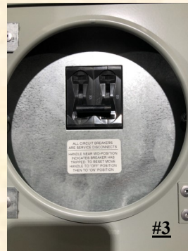
#3: Closeup shows 100 Amp breaker in the off position. (switch down)