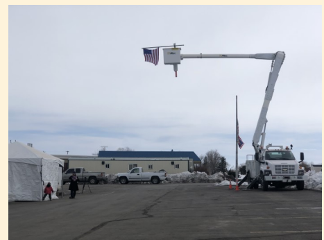
ANNUAL MEETING 2021