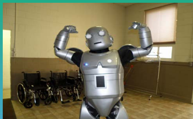
Power, from Tri-State G&T, came to visit our 80th Annual Membership Meeting.